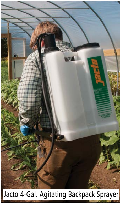
Jacto 4-Gal. Agitating Backpack Sprayer