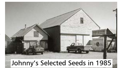
Johnny's Selected Seeds in 1985