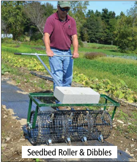
Seedbed Roller & Dibbles