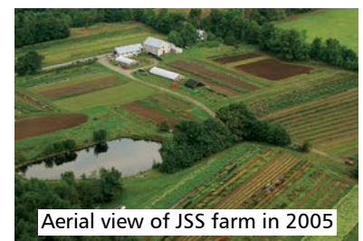
Aerial view of JSS farm in 2005