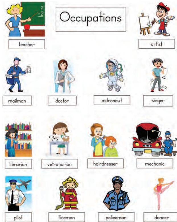
FIGURE 6.5A Vocabulary Card: Community Helpers