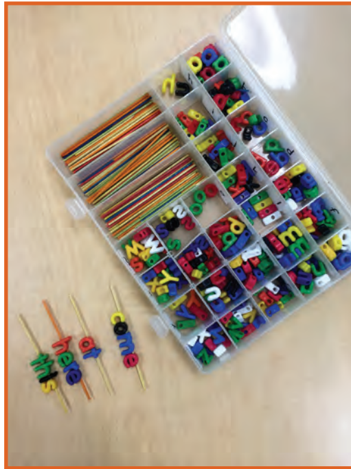
FIGURE 6.4 Letter Beads

Letter beads are a fun way to build words, but organization is the key! We put ours into a divided box that is labeled so each letter has its own home (Figure 6.4). This makes clean up each day much faster. Students can build high frequency words on pipe cleaners, strings, or thin craft sticks.