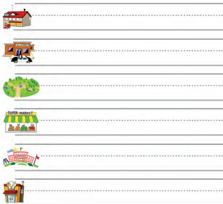
FIGURE 6.5B Clip Strip: Places in My Community