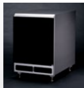
The WATCH Dog