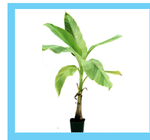
Banana Shipped As Shown