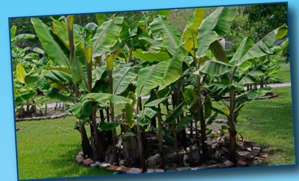
Hardy Banana Tree (Musa basjoo)