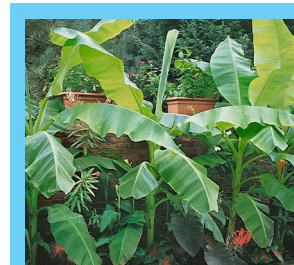
Tropical exotic look in gardens across the country