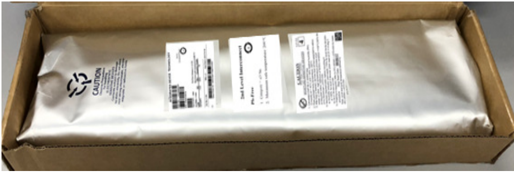
Existing Label Pasting