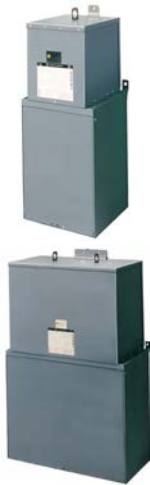
Table 14.11: Distribution System Square D Load Centers (allowing plug-on QO circuit breakers only)

New MPU solution leverages the latest load center interiors, giving customers more flexibility for branch circuit requirements. Additionally design with a tiered dead front construction. The first dead front allows access to the secondary main circuit breaker, distribution panel board, and the second dead front. The second dead front allows access to the primary main circuit breaker and incoming voltage connection points.