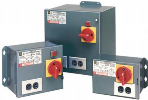
Transformer disconnects are available in NEMA Type 1 Standard, NEMA Type 12 Standard, and NEMA Type 1 Mini.

Square D™ brand transformer disconnects mount inside or outside a control system enclosure. The transformer disconnect being connected directly to the 480 Vac system controls power for auxiliary, single-phase loads when the main three-phase disconnect is either ON or OFF. The transformer disconnect is normally wired to the line side of the control panel's main disconnect.