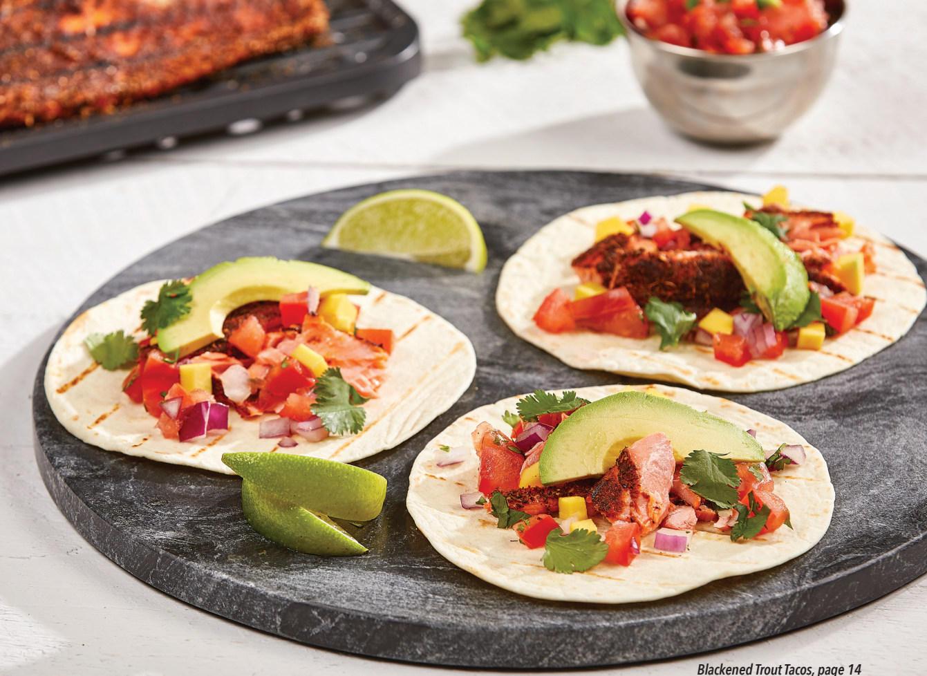
Blackened Trout Tacos, page 14

PowerXL ™ products that excel SMOKELESS GRILL