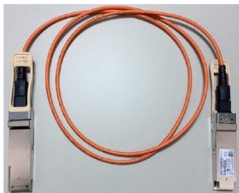
Figure 4. Cisco 40G QSFP active optics cables

Cisco QSFP to QSFP copper direct-attach 40GBASE-CR4 cables (Figure 5) are suitable for very short distances and offer a flexible way to connect within racks and across adjacent racks. Active optical cables are much thinner and lighter than copper cables, which makes cabling easier. Active optical cables enable efficient system airflow and have no EMI issues, which is critical in high-density racks. Cisco currently offers active optical cables in lengths of 1, 2, 3, 5, 7, 10, 15, 20, 25 and 30 meters.