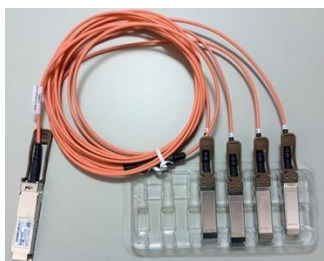
Figure 5. Cisco 40G QSFP to Four SFP+ breakout active optics cables

Cisco QSFP to four SFP+ active optical breakout cables (Figure 4) are suitable for very short distances and offer a flexible way to connect within racks and across adjacent racks. Active optical cables are much thinner and lighter than copper cables, which makes cabling easier. Active optical cables enable efficient system airflow and have no Electro Magnetic Interference (EMI) issues, which is critical in high-density racks. These breakout cables connect to a 40G QSFP port of a Cisco switch on one end and to four 10G SFP+ ports of a Cisco switch on the other end. Cisco currently offers active optical breakout cables in lengths of 1, 2, 3, 5, 7, and 10 meters.