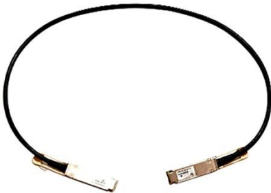
Figure 2. Cisco 40GBASE-CR4 QSFP direct-attach copper cables

Cisco QSFP to QSFP copper direct-attach 40GBASE-CR4 cables (Figure 3) are suitable for very short distances and offer a very cost-effective way to establish a 40-gigabit link between QSFP ports of Cisco switches within racks and across adjacent racks. Cisco currently offers passive cables in lengths of 0.5, 1, 2, 3, 4 and 5 meters and active cables in lengths of 7 and 10 meters.