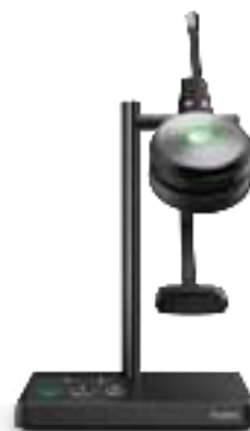
WH62 Mono Teams WH62 Mono UC