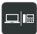
Multiple Devices Connection