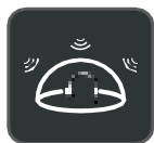
Acoustic Shield Technology

The Yealink WH62 is a new entry-level DECT wireless headset, with WH62 Dual and WH62 Mono two models. Work seamlessly with major UC platforms and integrate natively with Yealink IP phones. For crystal sound experience, Yealink Super Wideband Technology and Acoustic Shield Technology make you talk and hear clearly during phone calls and video conferencing. With easily on-ear control, interruption free, comfortable wearing, WH62 is a nice partner either for communicating or collaborating.