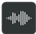
Optima Audio Experience