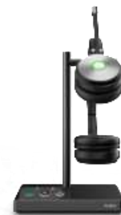
WH62 Dual Teams WH62 Dual UC

Based on hundreds of headform evaluations and thousands of wearing comfort tests, WH62 well meets the ergonomic requirements. Besides, with premier soft leather cushions and lightweight design, you can wear it all day comfortably. For more workspace freedom, WH62 can also free you up to 160m away from the desk.