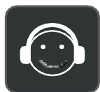
All Day Wearing Comfort