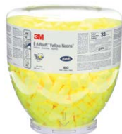
E-A-Rsoft™ FX™ Earplugs Prod. No.: 391-1012