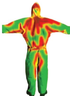
3M™ Protective Coverall 4540+ without breathable panel