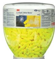
Yellow Neons™ Earplugs Prod. No.: 391-1004