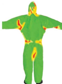
3M™ Protective Coverall 4540+ with breathable panel

Breathable SMMMS fabric back panel helps to improve air ventilation and reduce heat buildup.