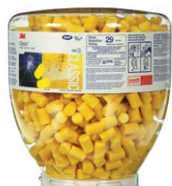
Classic™ Earplugs Prod. No.: 391-1002