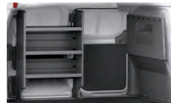
NV200 Compact Cargo 32" shelving unit and a steel or wire partition