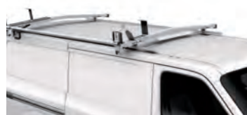
NV Cargo Standard Roof Cargo partition and EZ Load Ladder Rack