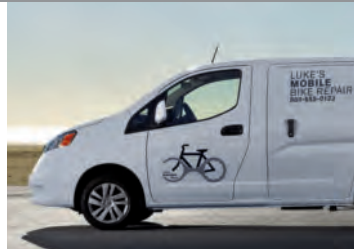
Vehicle Graphics 25