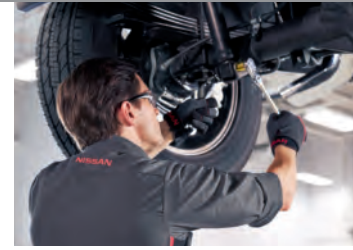
Extended Service Contract 27