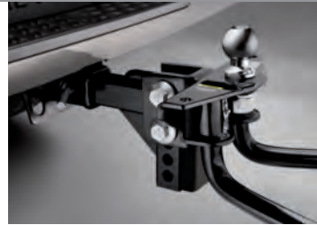
Genuine Nissan Accessories 26