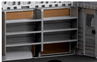
NV Cargo High Roof Cargo partition and three 44" wide shelving units