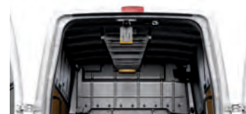
NV Cargo High Roof Cargo partition and interior overhead ladder keeper