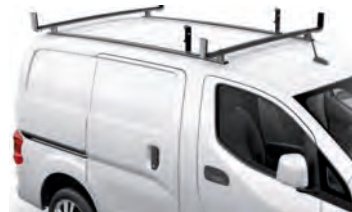
NV200 Compact Cargo Wire partition and 2-bar ladder rack