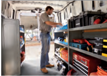
Upfit Packages 4