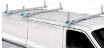
NV Cargo Standard Roof Cargo partition and 3-bar utility rack

Business Certified Dealers offer a choice of interior shelving, exterior roof racks, and include a cargo partition wall. Available on NV ® Cargo and NV200 ® Compact Cargo.