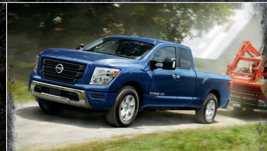
TITAN ® SV King Cab ® 4x4 shown. 11