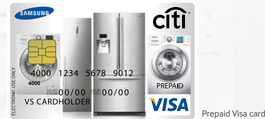
Prepaid Visa card

Samsung is now offering up to £150 cashback on selected home appliances*. Simply make a qualifying purchase between 28th March and 30th June 2013 , from the Samsung Home Appliance range, and claim your cashback via redemption by 28th July 2013 and you will receive a Visa Prepaid card within 28 days.