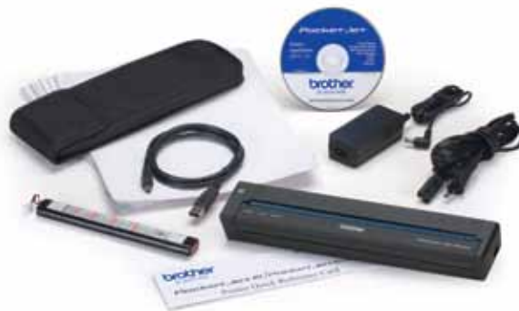
All PocketJet® 6 and PocketJet® 6 Plus Kits include a printer, carrying case, NiMH battery, USB cable, AC adapter and power cord, a pack of letter-size thermal paper, roller cleaning sheet, software CD, and documentation.