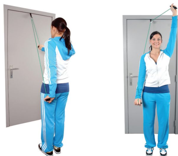
Up and Down Facing the Door

All these exercises can also be performed in a standing position: