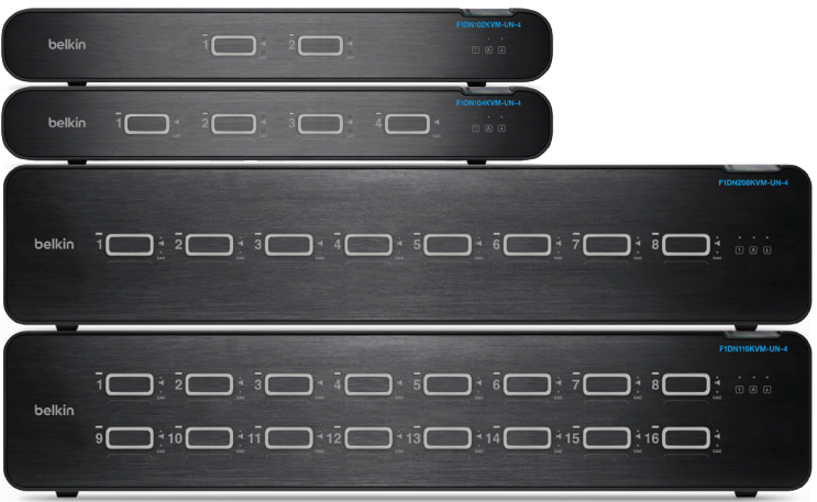
Front of Universal 2nd Generation SKVMs