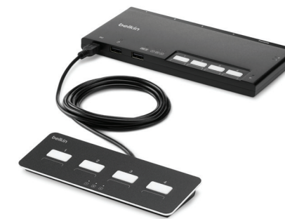
4-Port, Single-Head Modular Secure KVM Switch w/Remote F1DN104MOD-BA-4