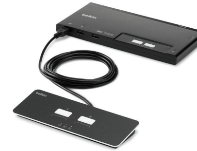
2-Port, Single-Head Modular Secure KVM Switch w/Remote F1DN102MOD-BA-4