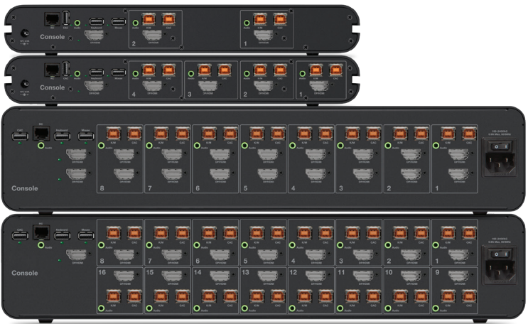
Rear of Universal 2nd Generation SKVMs