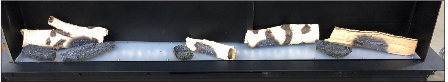
Figure 5. Place Small Logs