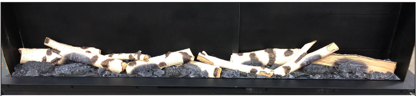
Figure 7. Log Placement Reference per Appliance