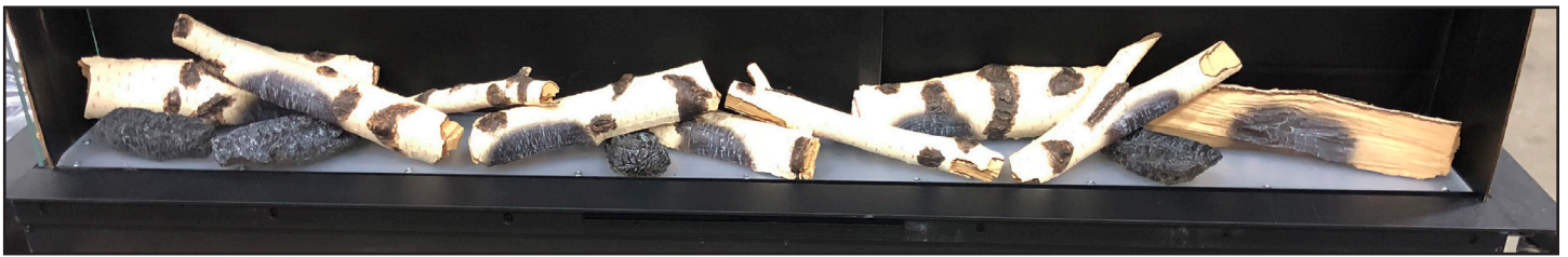
Figure 6. Place Remaining Logs