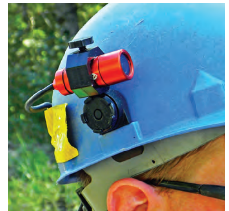
Figure 2. Detail of the camera mounted on a worker’s hard hat.