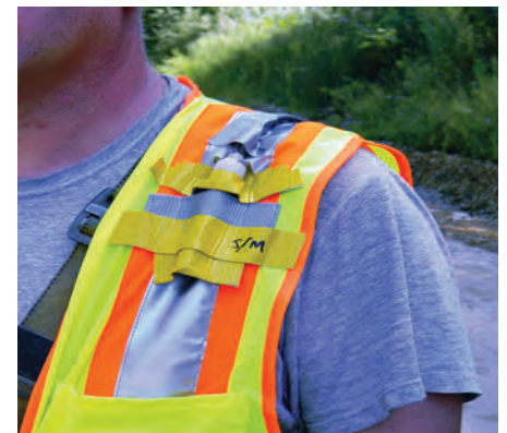
Figure 3. Detail of dust sampler inlet location (10-mm Dorr-Oliver nylon cyclone).