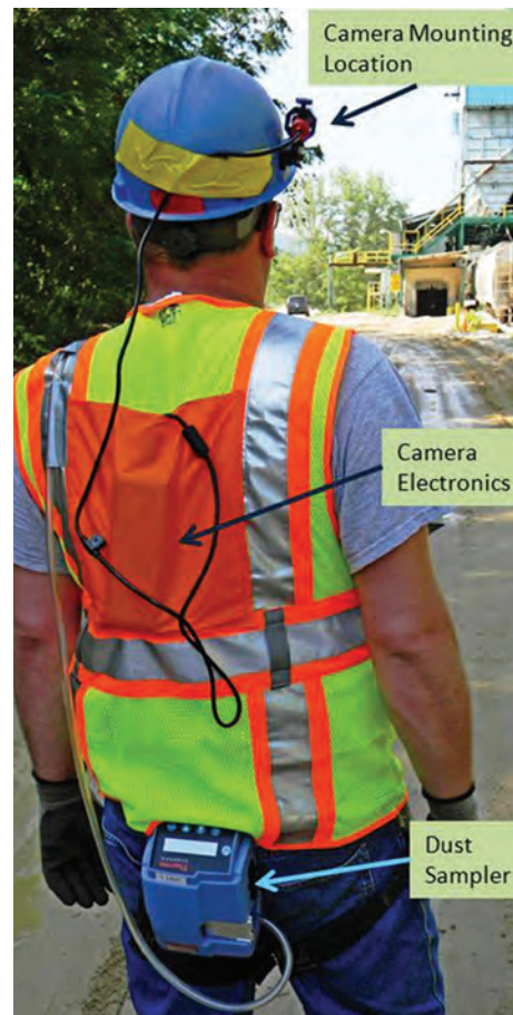
Figure 1. A worker equipped with a video recording camera and dust sampler.

A note about gathering video and exposure data simultaneously: one of the pioneering reports on the VEM method discussed an issue that the authors termed “system response time” or “transportation lag.” This lag is the combination of the delays associated with movement of the contaminant from its source to the worker’s breathing zone and the response time of the monitoring instrument. As a result, the concentration values reported by the monitoring instrument trail the activity displayed in the video image. The magnitude of this