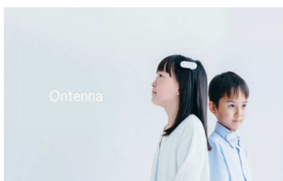
Ontenna in use

Fujitsu is working on the development and deployment of Ontenna, a product that enables the hearing impaired to feel sound through vibration and light. Ontenna is a user-interface device that can be worn on the hair, earlobe, collar, cuff, etc., and allows the wearer to pick up tonal characteristics through vibration and light. Ontenna is now provided free of charge to around 80% of schools for the deaf, where it is used in speech and rhythm practice. Fujitsu has also developed a user-programmable application for use in schools for the deaf and other educational institutions around Japan, allowing children to easily customize the intensity of Ontenna's vibration and the color of the light according to the volume of the sound for the desired reaction. Fujitsu was able to create a high-quality educational solution that could not be achieved simply with conventional ICT education, making it possible for the hearing impaired to experience a new world of sound. Fujitsu is also helping to facilitate an understanding of diversity in society by making it possible for more people to experience Ontenna through free lending and program rental at schools and educational institutions interested in programming training using this device.