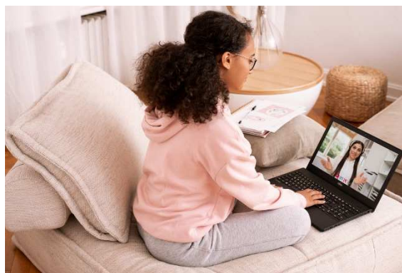
Using a donated laptop for remote learning

Many children have had to shift to remote learning from home because of the COVID-19 pandemic. Fujitsu UK has partnered with Centrica to create a system for refurbishing old business laptops and PCs and distributing them free of charge to families whose home environment prevents them from accessing a suitable level of distance learning. Approximately 350 devices have been distributed to date. PCs undergo a condition assessment and cleaning, data is securely erased, the latest operating system is installed, a final test is conducted, and each device is ready for delivery to a family the next day. These PCs also contribute to the psychological care of children while they are unable to leave the home, because a computer allows a child to communicate with friends and teachers in the outside world.