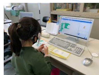
The application in use at a school for the deaf