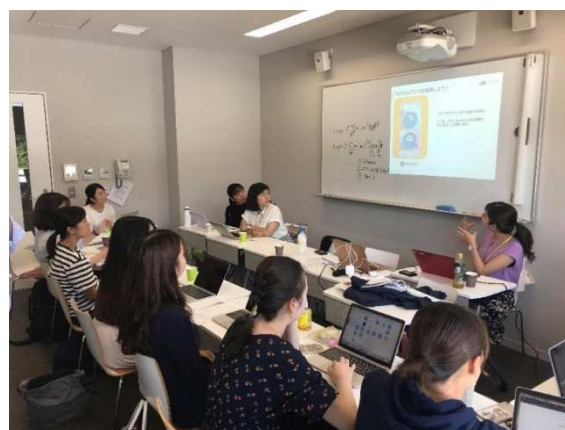
Students participating in a coding class

With the aim of fostering female talent to lead the Society 5.0 era, the Fujitsu Group and other member organizations have launched the Women's University Students ICT-driven Social Innovation Consortium (WUSIC). This is an industry-academia collaboration comprising two universities and three companies (Tsuda University, Japan Women's University, FJCT, Fujitsu, and Asia). Coding classes for cloud-based smartphone app development are being held along with networking events, and opportunities are being provided to promote the use of the apps and match businesses with university talent. A total of 143 female university students have participated in this program, with approximately 40 sessions being held so far. Fujitsu will continue to support the training of IT talent, fostering the study of coding to enhance ICT literacy and contributing to the development of planning and presentation skills essential for success in business.