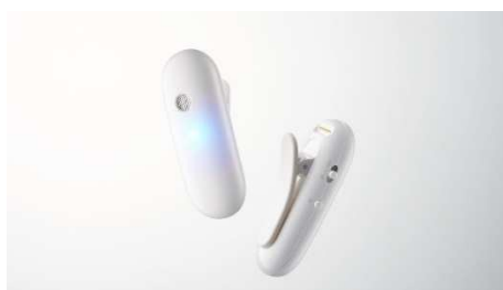
The vibration intensity and light color can be customized