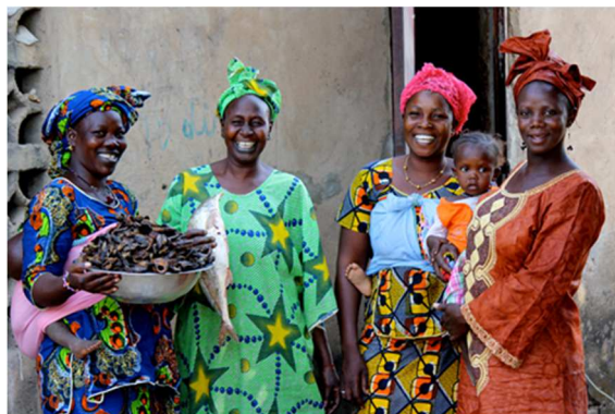
Entrepreneurs who have received funding

Fujitsu Group company, Ridgelinez Limited, is a transformation design firm that creatively integrates strategy, design and technology, acting as a pacesetter for leaders who aspire to a people-centric approach to transformation. Fujitsu believes that it is important for all employees to be personally aware of the SDGs and the need to contribute to sustainability. The company is therefore participating in programs established by Kiva Microfunds(*1), a U.S. NPO that supports the provision of microfinance(*2) to entrepreneurs in developing countries. Through the sustainable microcredit activity enabled by the Kiva crowdfunding platform, Ridgelinez is providing new business opportunities for entrepreneurs to purchase farm equipment for greater yields, to improve the communication environment for children's mobile learning, and to launch pharmacies to support the health of local communities. By discovering what drives leaders who aspire to change and by supporting their activities, the company is fostering a culture of 'acting to change the world and society'. As a transformation design firm, Ridgelinez will continue to provide sustainable support so that people around the world can enrich their lives and proactively take on new business challenges.