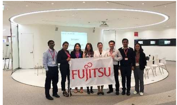
Fujitsu Scholarship recipients

Fujitsu contributes to society by providing education rooted in the global community and offering scholarships to those aiming to help their own country or local community, thereby developing business leaders and promoting cultural exchange and mutual understanding.