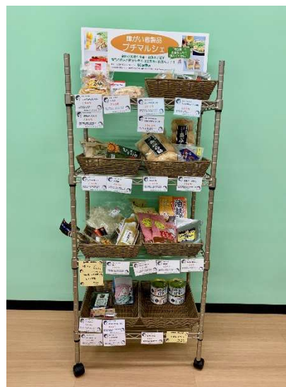
The unattended sales cart "Petit Marché" in a Fujitsu office

Fujitsu's office and other Fujitsu Group companies in the Kansai region have partnered with an accredited NPO that sells vocational products assembled by people with disability. Together, the companies organized the in-house sale of the eye-catching products made at disability workshops throughout Japan. An unattended sales cart called "Petit Marché" was designed as a permanent fixture to display the goods available, allowing work-from-home employees to make purchases whenever they visit the office. Fujitsu's partnership with the NPO led to flourishing sales, as together they planned and selected products, replacing and restocking the goods on a regular basis. This not only served as a chance for Fujitsu employees to better understand the importance of social contribution, but also provided an opportunity for the NPO to improve its sales know-how. The initiative is also contributing to the revitalization of local communities by connecting Fujitsu employees, who may find it hard to otherwise make a social contribution, with the issues commonly encountered by disability centers and NPOs that are not accustomed to marketing their products.