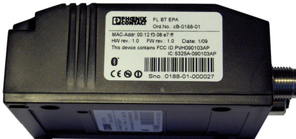
Figure 3 Label mounted on the plastic housing side