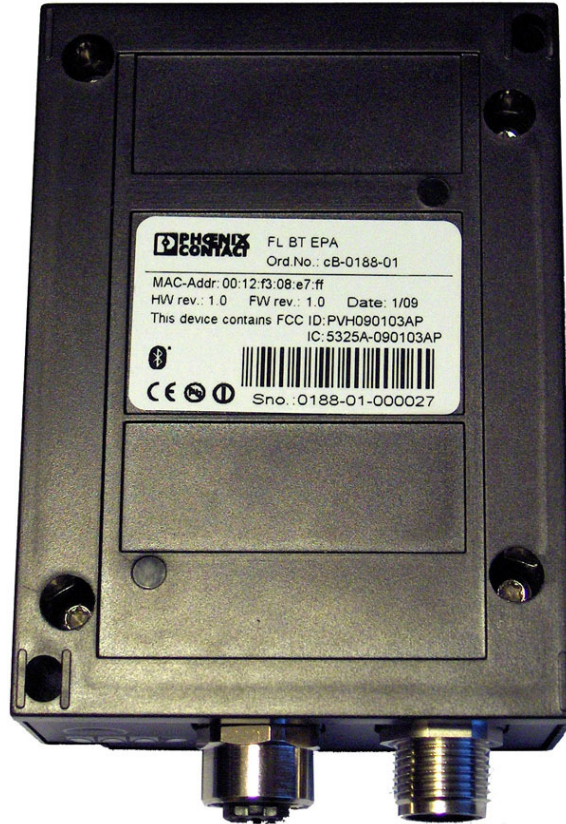
Figure 2 Label mounted on the plastic housing back