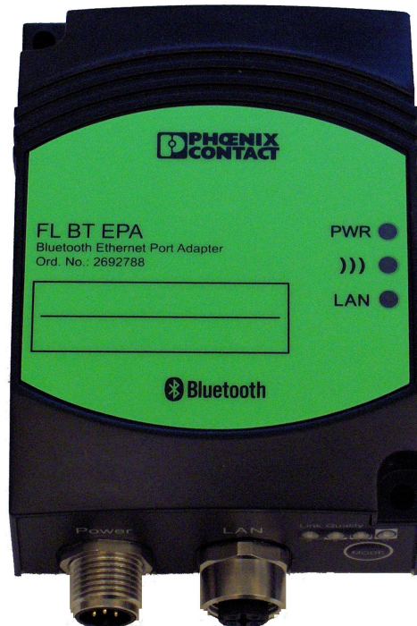
Figure 1 Front label mounted on the plastic housing