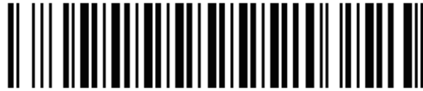
BlueTooth pairing mode

If you need quick access to scan the device Bluetooth pairing mode, use the scanning equipment to scan read the following illustration of "Bluetooth pairing mode" bar code. Scanning devices in the pairing process will continue flashing blue, blue light goes out after the pairing is successful.