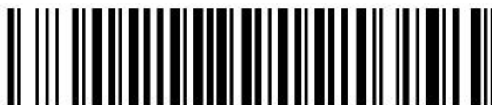
Statistical number of stores

(3) The customer can also scan the "statistics storage number" bar code to view the storage section, to check the upload data entry correct or not .